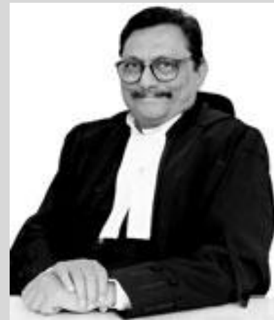
Hon'ble Mr. Justice Sharad Arvind Bobde Sitting Judge, Hon'ble Supreme Court of India. Visitor, The National Law Institute University, Bhopal.