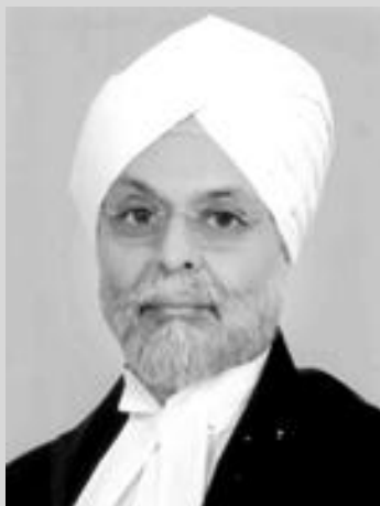
Hon'ble Mr. Justice Jagdish Singh Khehar Chief Justice of India.

Authorities of NLIU as on April 01, 2017: