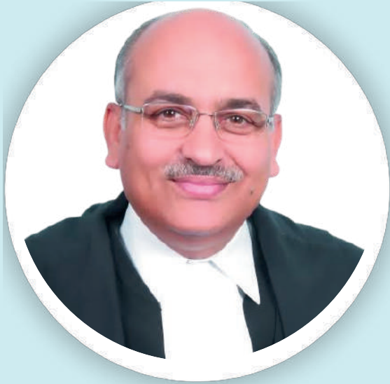
PATRON - IN- CHIEF Hon'ble Mr. Justice Pankaj Mithal, Judge, Supreme Court of India Visitor National Law Institute University, Bhopal (Madhya Pradesh) India